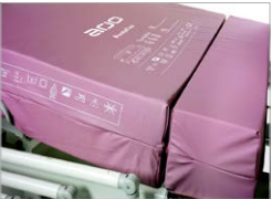
Optional Squabs – Available for extending beds

SUITABLE FOR PROFILING BEDS Suitable for use in the gatched or supine position.