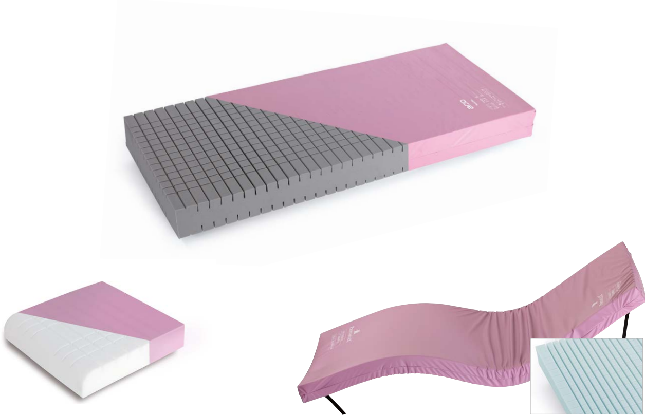
24 Hour Care Package – Seat cushion available

The Pentaflex range has been designed with a wide range of patients in mind, including those with superficial pressure injuries (when used in combination with an overall care plan).