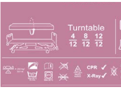
TurnTable Guide – All Pentaflex mattress replacement systems carry the TurnTable Guide